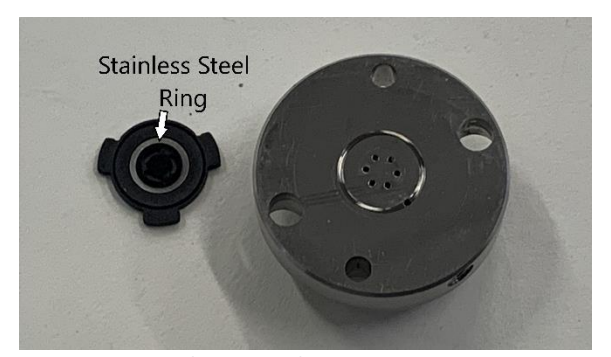
Figure 2 Original Stator and Rotor

Rotor with the stainless-steel ring must be used with the uncoated stainless-steel stator. Rotor part number for use with the uncoated stainless-steel stator is #60-5234-118.