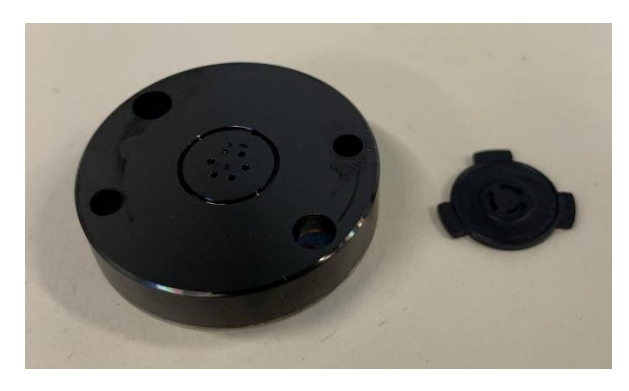
Figure 4 Coated Stator with solid black rotor

Coated stator must be used with the solid black rotor. Rotor part number for use with the coated stator is #60-5234-852.