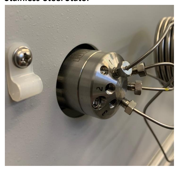
Figure 1 Original Uncoated Stainless-Steel stator installed in the ACCQPrep