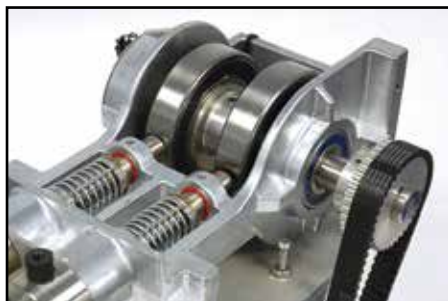
Rugged Construction with Belt Drive and Eccentric Cams.

The HF Series pumps are dual-headed piston pumps with servo motors, belt drives, and reliable eccentric cams. Features include an LCD keypad with advanced HMI/PLC interface, and RS-232 for complete control and status monitoring. Prime-Purge Valve, Outlet Filter, and Pressure Transducer are also included.