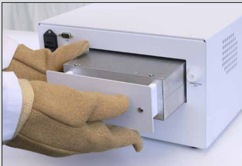
Aridus3 Removable Membrane Desolvator Module

The Aridus3 is equipped with a removable membrane desolvator module (depicted at right). The module is an integral part of the Aridus3 chassis and simply pulls directly out of the back panel (no need to open the main cover). Once removed from the Aridus3 , the membrane desolvator module can be conveniently cleaned or replaced. A dedicated rinse kit is provided to introduce an appropriate cleaning solution such as dilute nitric acid.