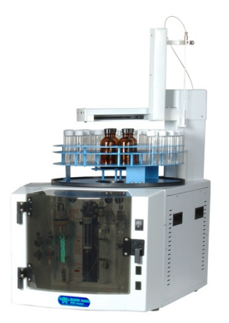
Figure 1. Teledyne Tekmar's Fusion TOC Analyzer

This application note will present data following these strict criteria. In addition, this study will verify the suitability of Teledyne Tekmar's TOC Analyzer (Figure 1) for analysis of TOC at 0.05 mgC/mL, as opposed to the current standard of 0.5 mgC/L.