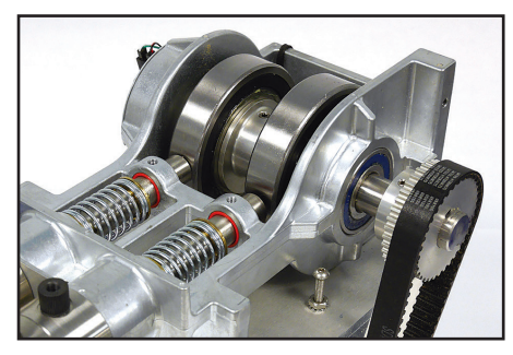
Rugged Construction with Belt Drive and Eccentric Cams.

The HF Series pumps are dual-headed piston pumps with servo motors, belt drives, and reliable eccentric cams. Features include an LCD keypad with advanced HMI/PLC interface, and RS-232 for complete control